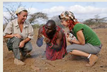
Dream holidays in Kenya: Delicious food, good company (centre). A Masai will be happy to show you how to make a fire during a walking safari (right).

Black magic: Kerosene lamps set a romantic light in your safari tent