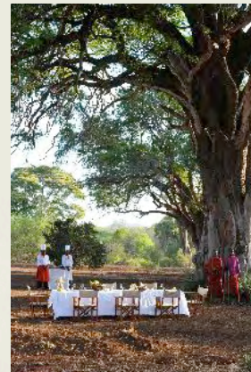
Bush-breakfast de luxe under a Baobab tree