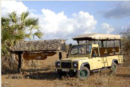
Adventurous Africa: Games drives with an open-air jeep